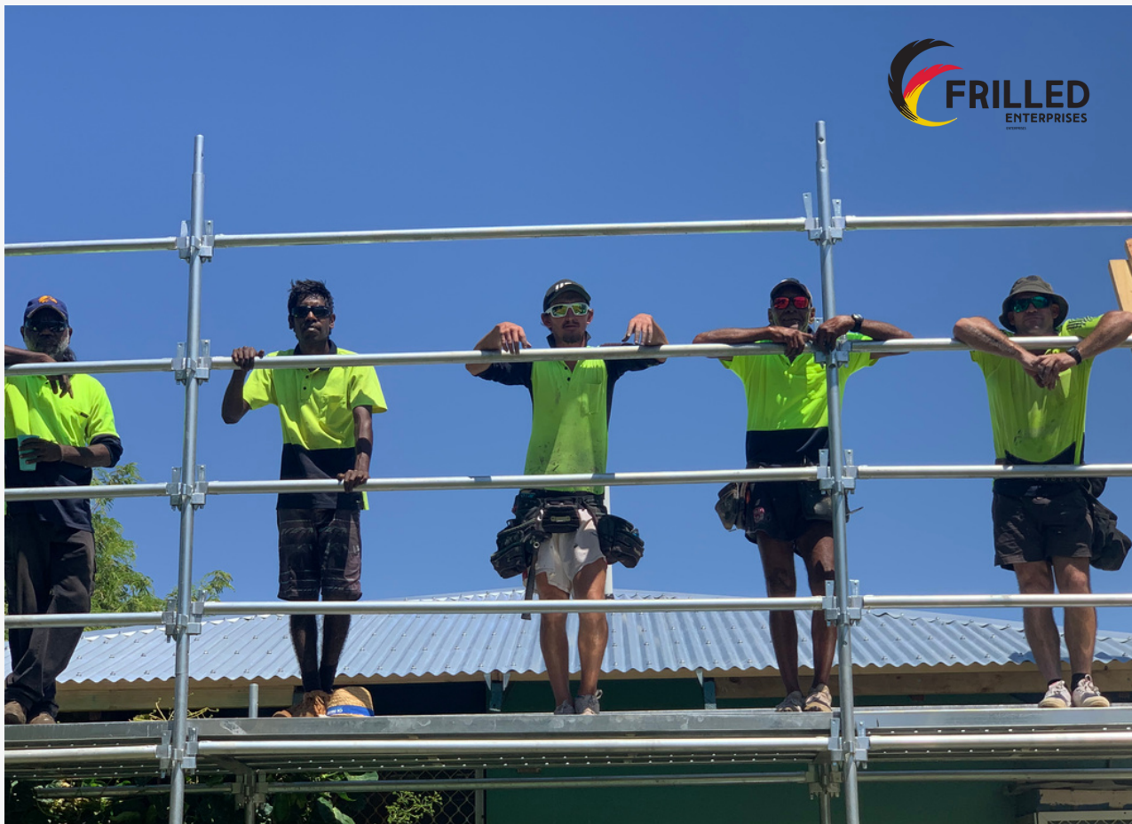
Above: West Kimberley Labour Hire boys